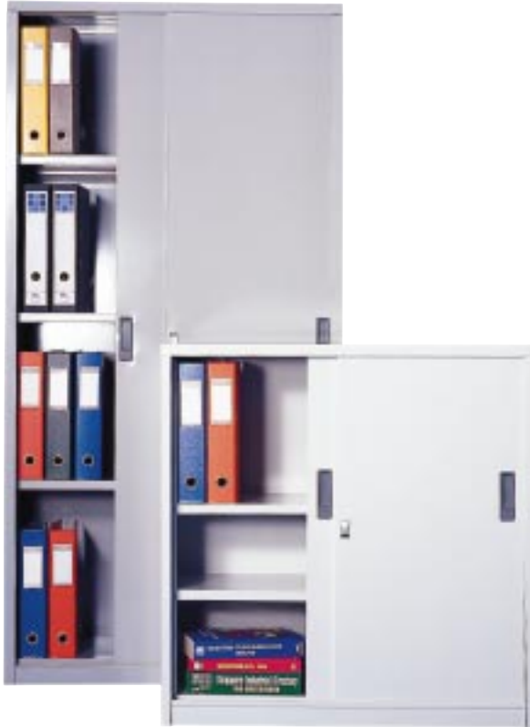
ASD - 980/450 M Half height sliding door cupboard