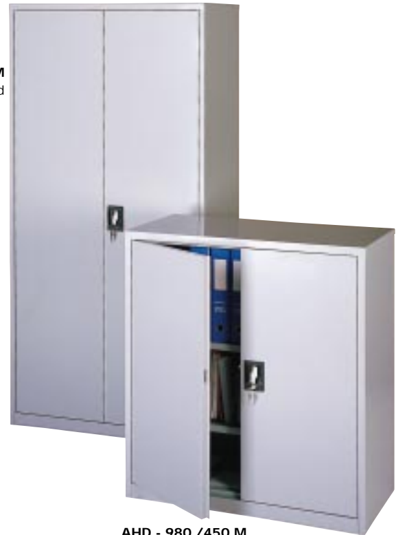
AHD - 980 /450 M Half height swing door cupboard